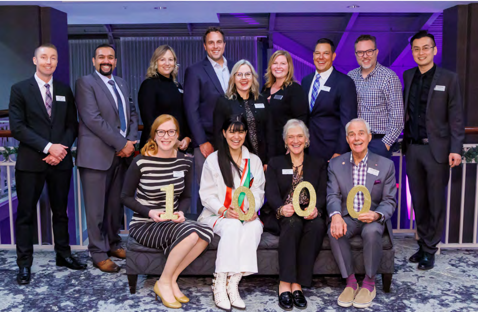
Tri-Cities Chamber of Commerce 2023 Board of Directors