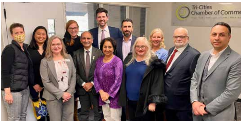
Chamber Roundtable with Canadian Minister of Immigration, Refugees and Citizenship Sean Fraser, April 2022

The Chamber was pleased to participate in community events, including Crossroads Hike for Hospice, Soroptimist of the Tri-Cities Give Her Wings Gala and Warm Place for Women, Austin Heights HollyDaze, Port Coquitlam May Days Mayor's Breakfast, Tri-Cities Remembrance Day Ceremonies, Inaugural Council Meetings, Inaugural SD43 Board of Education Meeting, Port Coquitlam Christmas Tree Festival, Port Moody Spike Awards, Coquitlam Express Golf Tournament and Hockey Game Puck Drop, and more.